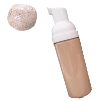
DL/113 Water Mousse Foundation